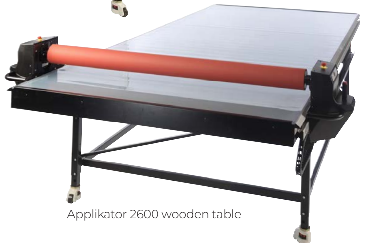
Applikator 2600 wooden table